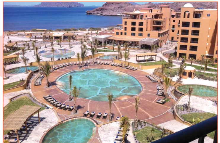
Villa del Palmar Loreto

Villa del Palmar Loreto – The rustic beauty of Loreto is its most compelling feature, and with the great tour packages the resort has put together, you could visit the Villa del Palmar Loreto over and over and never have the same experience twice. Tours are available 8 days/7 nights or 4 days/3 nights. If you want a memorable adventure, just choose from these exciting tour packages: