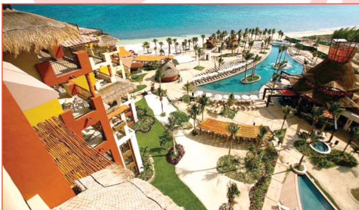
Villa del Palmar Cancun

“The service in this place is amazing; everyone is friendly and wants you to have a great time if you let yourself. The staff is working hard and I think they have one of the best programs I have seen.”