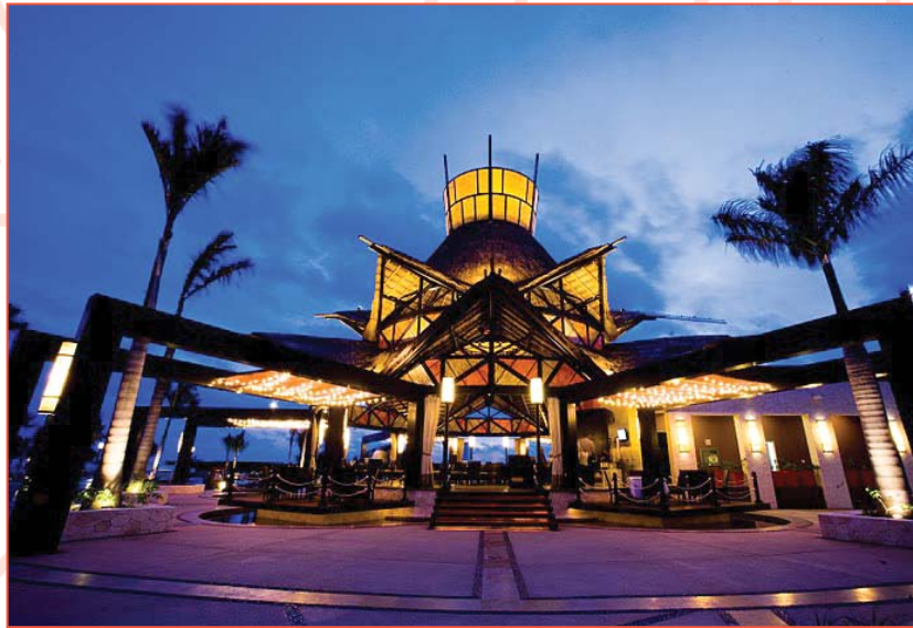
Zama Restaurant at night.

memorable evening under the stars that you and your loved one will keep in your hearts forever.