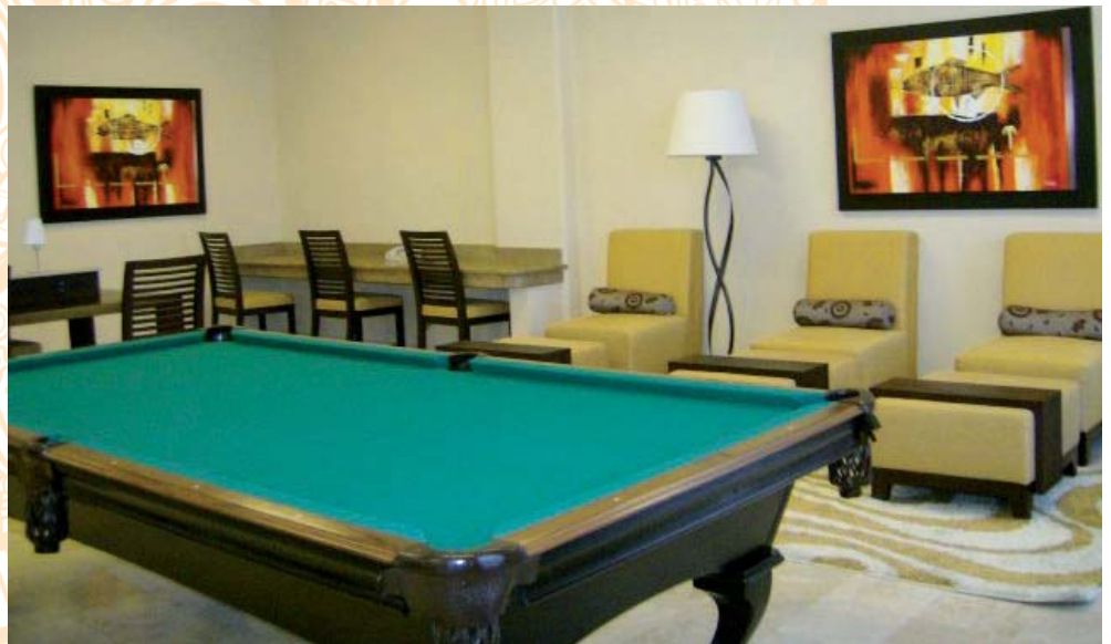
VDP Cabo recently remodeled Hospitality Suite.