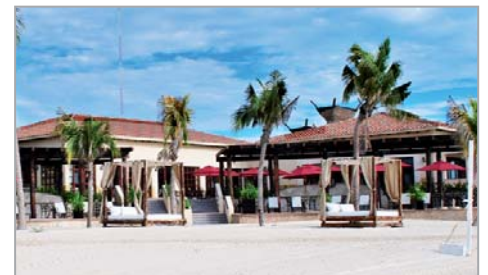
Villa Del Palmar Cancun