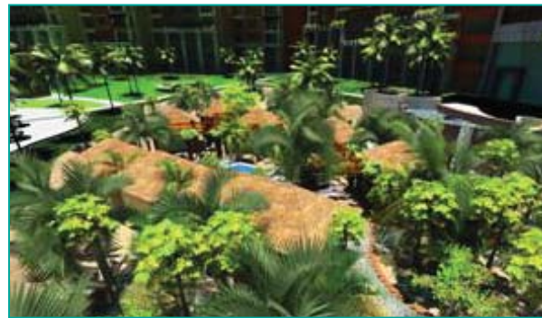
Spa Village rendering

treatment while also soaking in the restorative powers of nature is a double dose of relaxation that members and guests will not be able to resist.