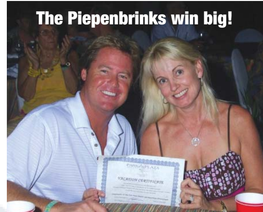
The Piepenbrinks win big!

Flamingos - The resort hosted the events to perfection. Friendly and professional staff, delicious food and a beautiful venue set the stage for a successful and enjoyable meeting. The final count was over 300 people in attendance – our largest meeting ever! Here are